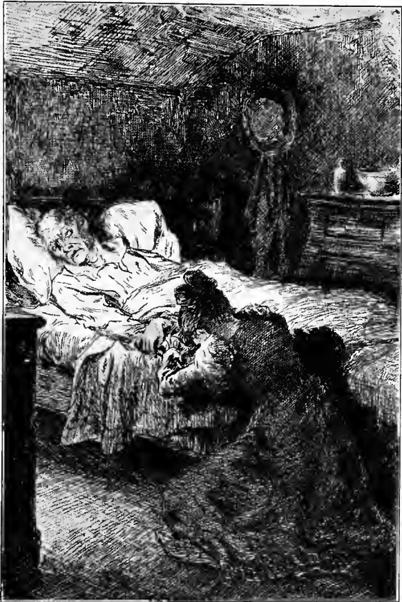
“ Mme. de Restaud took her father's hand and kissed it ”